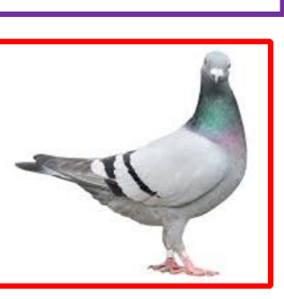
Congratulations Class 2. You had the tidiest cloakroom and Percy will be spending the week with you!

Please can I just remind everyone that as a school we are not permitted to authorise family holidays. If you check the attendance policy you will see that we can sometimes authorise a couple of days for special circumstances. Holiday is always an unauthorised absence and anything over 4 and a half days unauthorised absence is subject to a fine. As you will probably all be aware school attendance is a focus at government and local authority level at the moment. Fines are currently £60 per child per parent, rising to £120 if it is not paid within 21 days. From September this will rise to £80 per child per parent rising to £160 if not paid within 21 days.