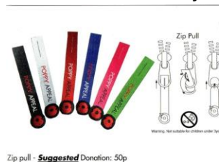
Zip pull - Suggested Donation: 50p

All donations via Parent Pay will be passed onto the Royal British Legion in full.