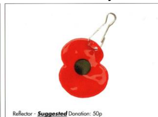
Reflector - Suggested Donation: 50p