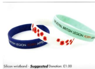
Silicon wristband - Suggested Donation: £1.00