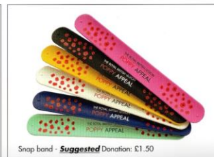
Snap band - Suggested Donation: £1.50

Last day for purchase is Tuesday 10th Nov.