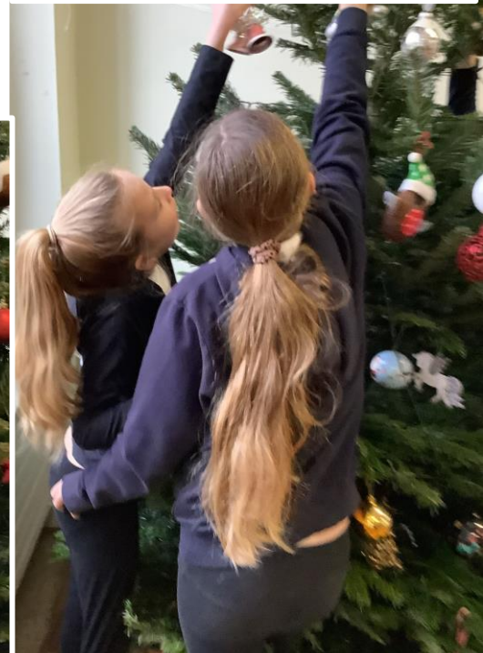
The Christmas Tree is up and decorated!!