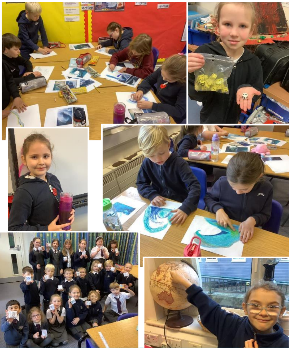
This week in photos. More information, videos and pictures found on our Facebook page.