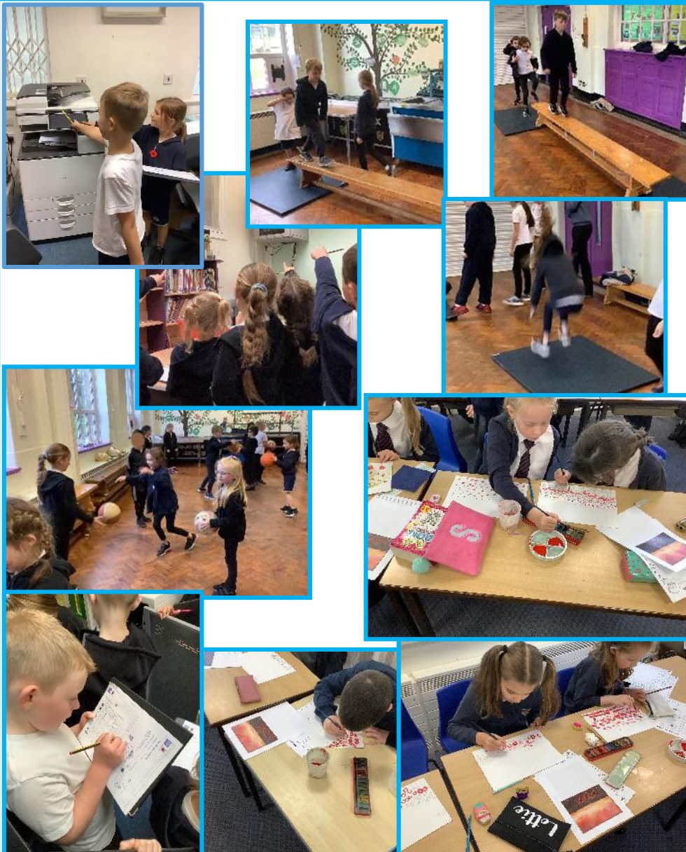
This week in photos. More information, videos and pictures found on our Facebook page.