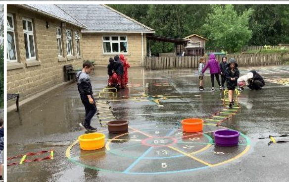
Tennis & Obstacle Course