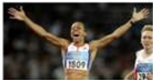
Kelly Holmes winning a race.