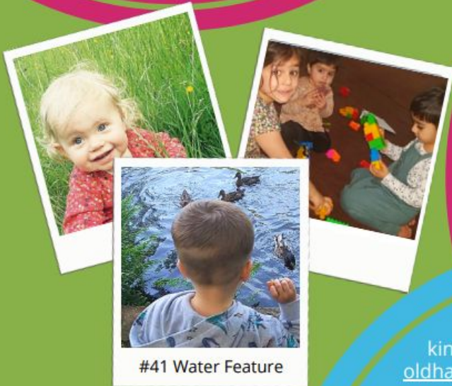
#41 Water Feature

For more updates, kindly visit our website oldham.50thingstodo.org