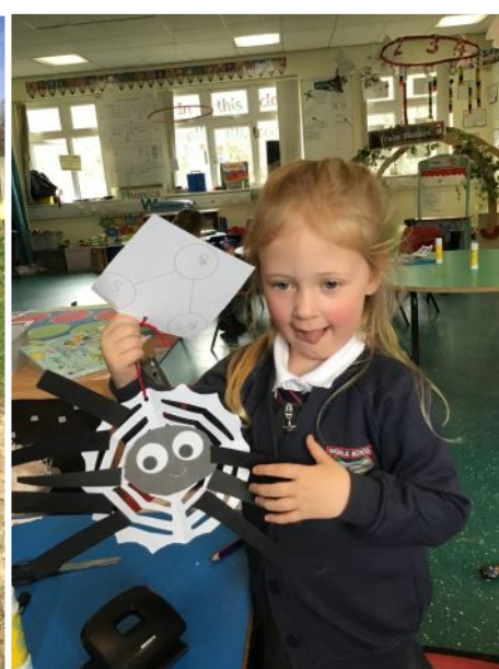
This week in photos. More information, videos and pictures found on our Facebook page.