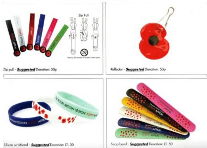
Zip pull - Suggested Donation: 50p

As with last year, we will also added a line for a general donation to the British Legion. No-one is obliged to donate using this option, however we appreciate many people do not carry cash with them any more to donate to street collectors. There are other ways to donate directly to the British Legion – search online for details. All donations via Parent Pay will be passed onto the Royal British Legion in full.