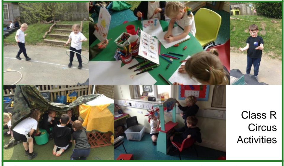
This week in photos. More information, videos and pictures found on our Facebook page.

We have settled back to school after our holiday and have been working hard this week. We have been using a muddled up traditional tale called 'Fe FI Fo Fum' to help us with some super work especially writing exclamation and command sentences which can be tricky. We have been solving word problems in maths and learning how to work systematically by breaking the problem down into steps. We did well. In theme we have made a start on learning about the Great Fire of London in 1666. We heard some eyewitness accounts, played a game, compiled a list of questions we wanted to investigate. We even had a Year 2 fire drill!