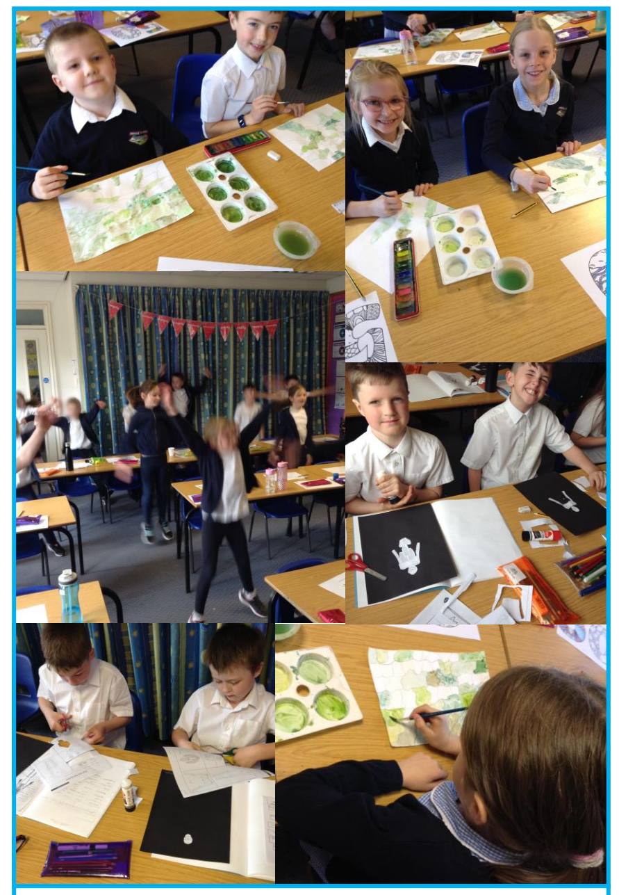
This week in photos. More information, videos and pictures found on our Facebook page.