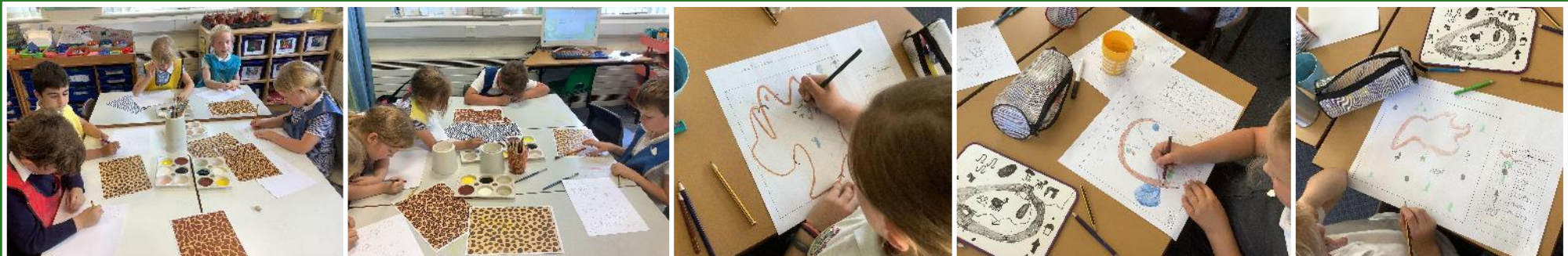
This week in photos. More information, videos and pictures found on our Facebook page.

Maths has included work on position and direction linked to our map work. We have also been using the rulers to measure in centimetres and metres. We measured ourselves and discovered that the tallest children in our class also have the largest feet. We compared and ordered objects according to height or length and solved some simple problems using measures. We took our sunflower seedlings home this week. We are going to record their progress in our sunflower diaries and share how much they have grown later in the term. In PE we worked on jumping. We learned techniques for long jump and hurdles and had some good team events. We played our recorders again and even managed a simple class duet with B!