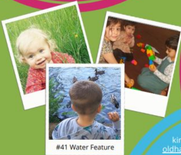
#41 Water Feature

For more updates, kindly visit our website oldham.50thingstodo.org