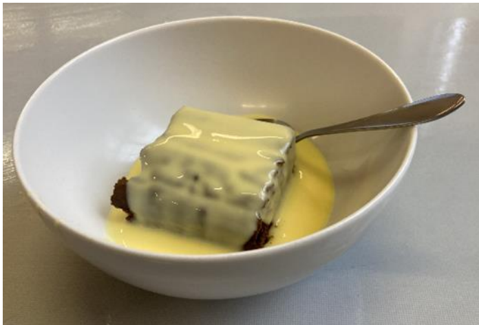
Chocolate Pudding and Custard

I know we're biased but we think these meals are amazing, not only do they taste good, but research from The Food Foundation says that 'children who eat school meals have lower obesity rates, better academic performance and behaviour, and improved lifetime productivity.' Why not give them a try!