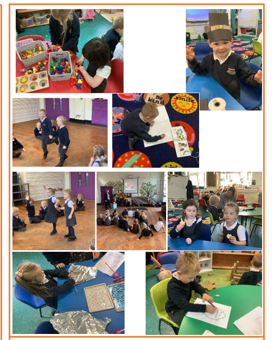
This week in photos. More information, videos and pictures found on our Facebook page.

Finally, we got to learn all about the road safety van which keeps us safe at school. The children found it fascinating seeing how the camera worked and they even got a chance to operate it.