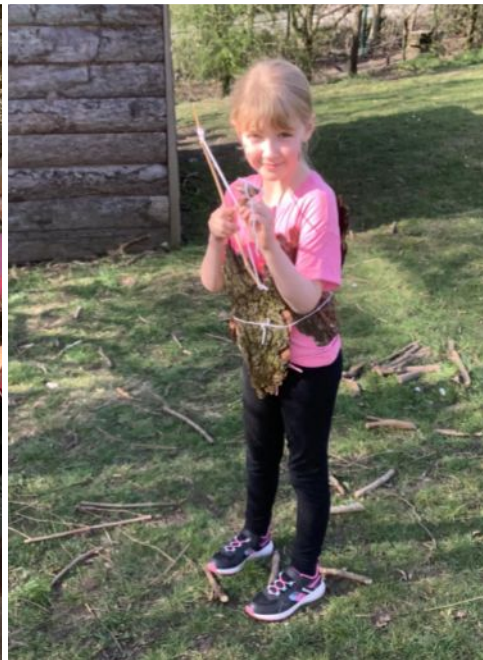
This week in photos. More information, videos and pictures found on our Facebook page.