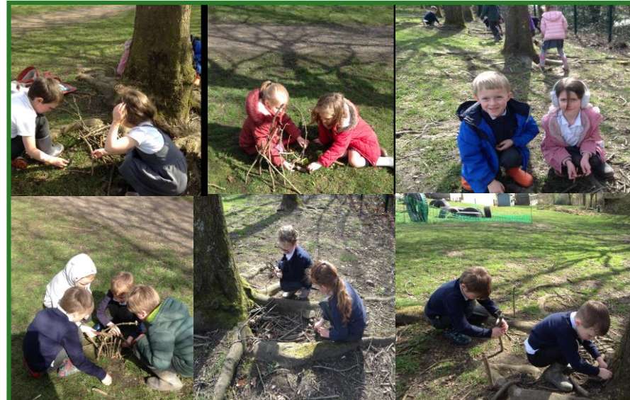
This week in photos. More information, videos and pictures found on our Facebook page.

This week we have looked closely at the story of Little Red Riding Hood and done some super writing! We have investigated the main characters and looked at story starters and settings. We have written a wanted poster for the wolf and openers and settings descriptions too. We will continue with this learning next week. In Maths we have been finishing our learning checks looking at what we know about place value and addition and subtraction. We have looked after our sunflower seeds carefully and are keeping our fingers crossed that we soon see some green shoots! In PE we have enjoyed learning some new activities which focus on developing our movement skills.