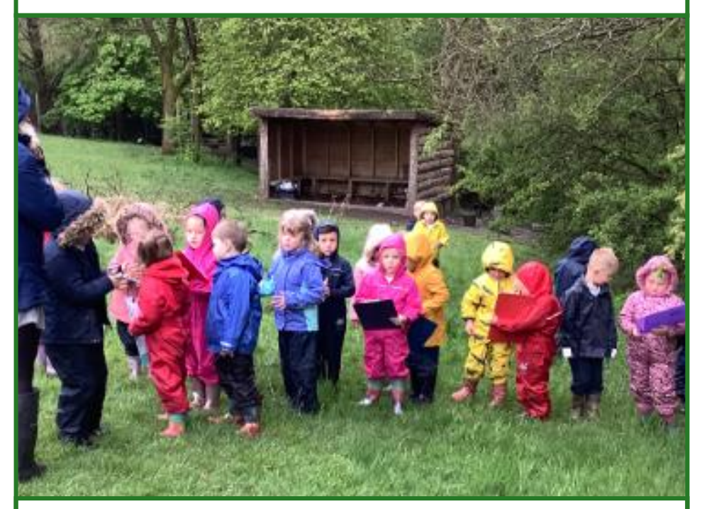
This week in photos. More information, videos and pictures found on our Facebook page.

This week we have worked hard on solving maths problems. The monster challenge was tricky, finding amounts only using silver coins. In English we have been reading different types of text and learning about inference in reading. We learned that we have to look carefully for clues and use reasoning as well. We finished off our theme work about the Great Fire of London by learning some rhymes and songs about what happened before, during and after the fire. We had great fun breaking all the rules on Thursday, what a fun way to end a busy half term!