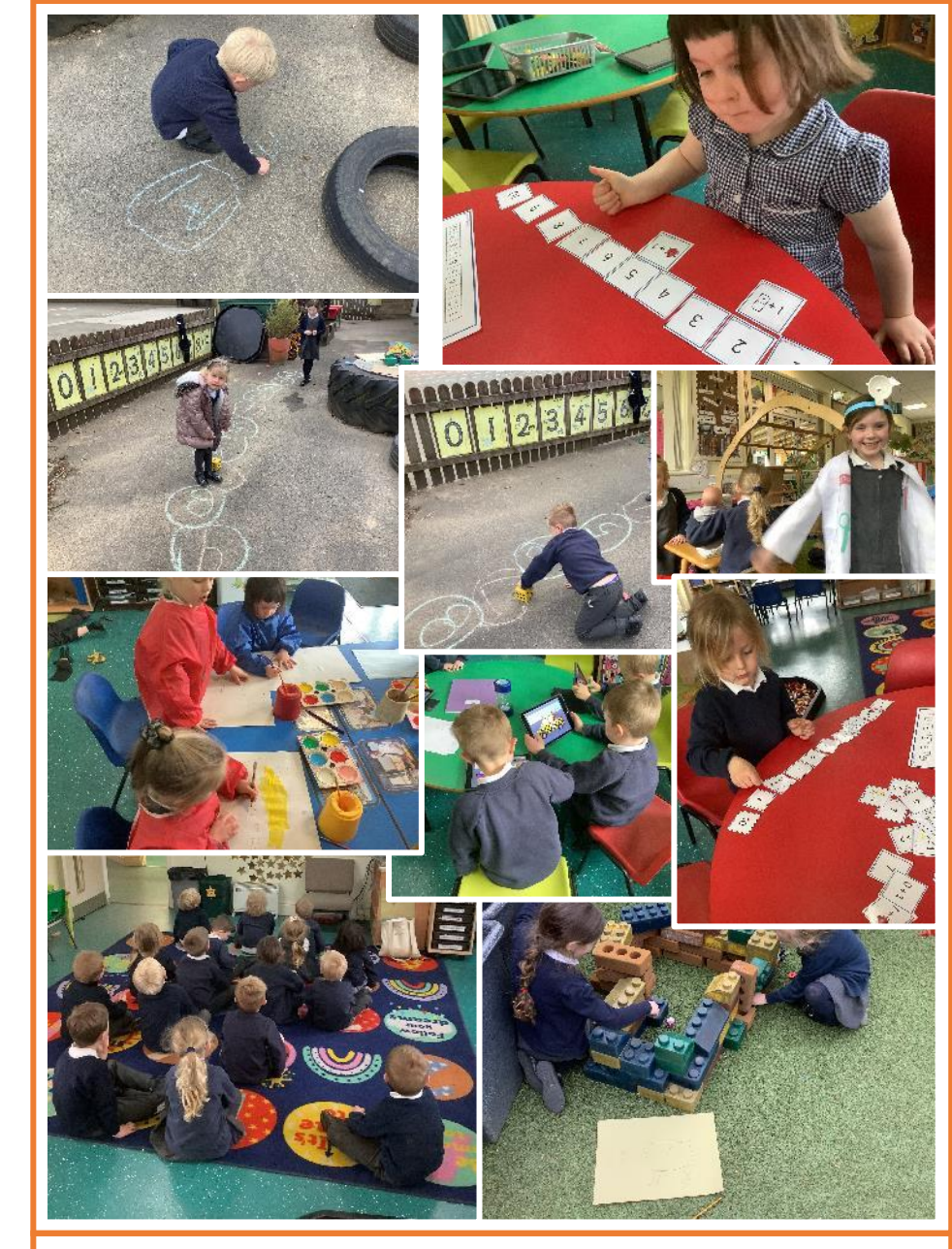
This week in photos. More information, videos and pictures found on our Facebook page.

The children also had lots of fun with different types of technology this week. The children used their prior knowledge of positional language to move the Bee-Bot transport around our small world town and they also tested different transport games on the iPads and voted which one they liked best.