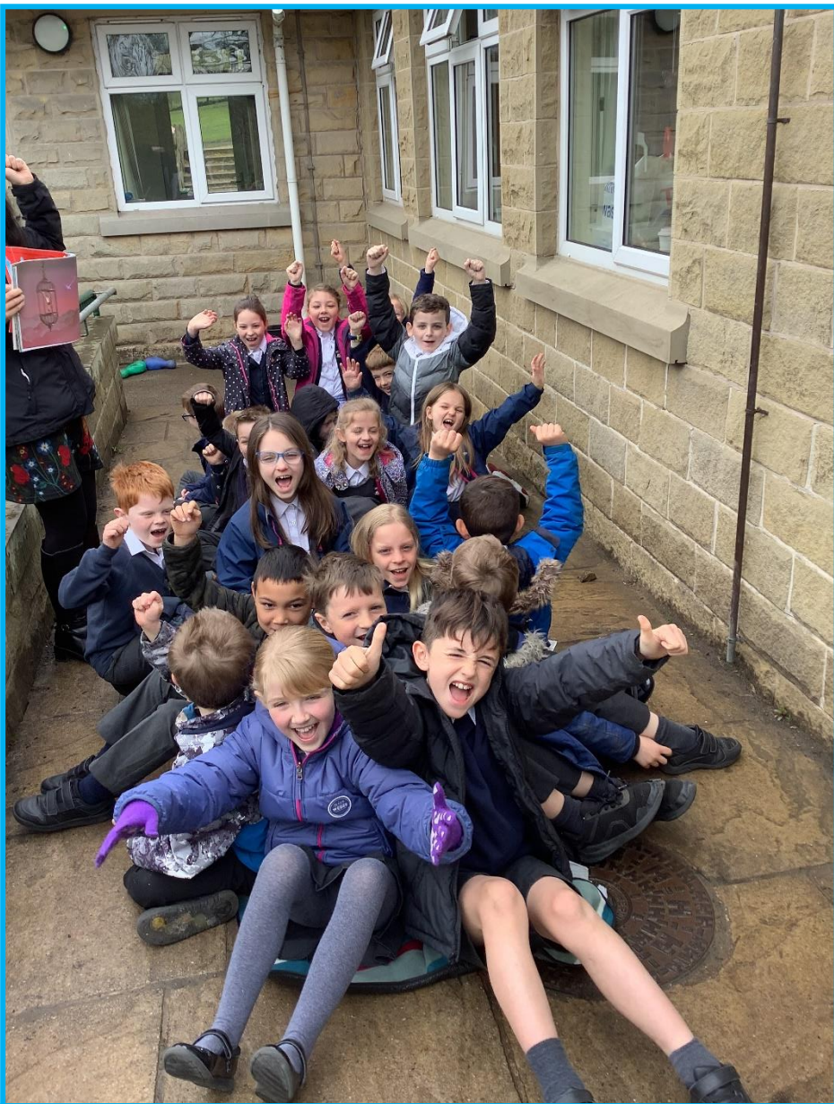
This week in photos. More information, videos and pictures found on our Facebook page.